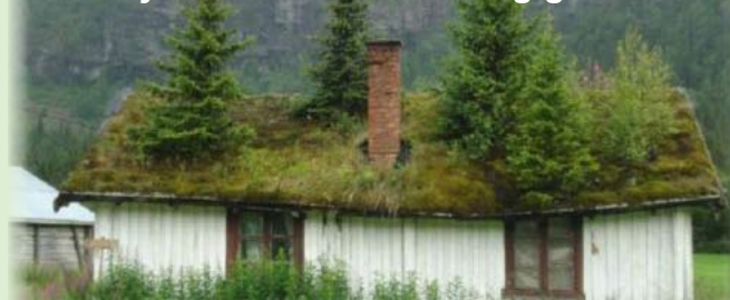
Probably not an award winning green roof