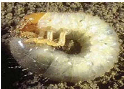
Here is a picture taken from my Polish Uncle Chafers' facebook page.

Recommendations at this time of year are to reseed damaged turf areas and try to keep the turf as healthy as possible. It is suggested that cultural controls may be adequate to keep the damage below a treatment threshold. Lawns should be monitored through the summer to examine for increasing grub populations (this requires slicing and lifting slabs of turf to examine the surface roots). If the larval populations exceed 5-10 per sq.ft and/or lawns are starting to become thin or rodent/bird feeding damage is noticed, then a control treatment may be warranted.